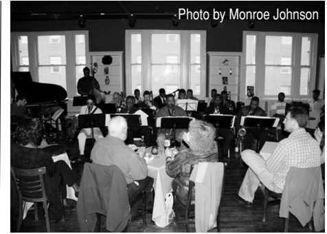
The Eubie Blake Legacy Big Band alone was worth the price of admission!

The mood was lightened with a tune called "Brother Ed," dedicated to an old